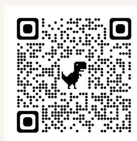
Student Resources Page