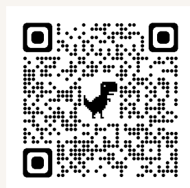
Student Resources Page