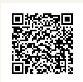
Program QR Code